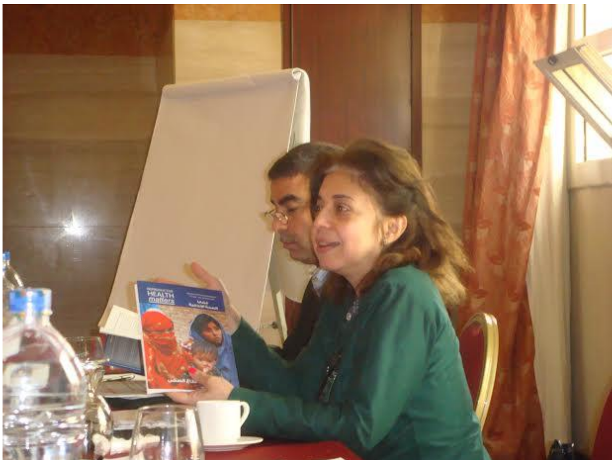
RHM in Arabic being distributed at the 2014 governmental conference of the Population Conference in Cairo

Research findings are only the first step in bringing about programme and policy change. Attributing impact to the findings of a single study is difficult as most changes happen as a result of multiple factors. Dissemination of study results has to be followed by specific strategy and action related to translating the knowledge into implementation and advocating for change. Most of the researchers featured in this supplement have continued to work with their study findings and with others in their countries in order to effect such change.